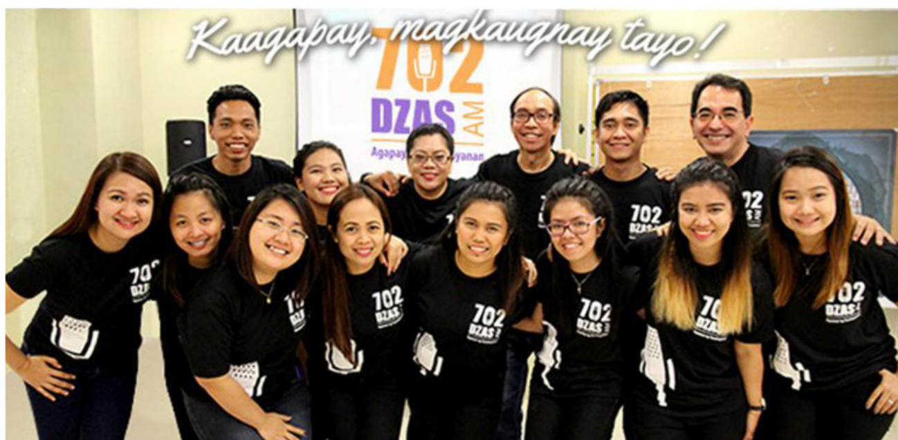
FEBC Philippines's radio station 702 DZAS is celebrating it's 68th Anniversary this year. This is the 702 DZAS team.

Fri 13 – A number of special programs are aired on commercial stations to reach specific people groups. Pray that God will use these strategically placed