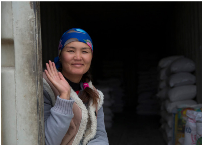
A listener from Kazakhstan

Sun 4 – WEEKLY SUMMARY: Due to recent terrorist activities in the Middle East by ISIS and other terrorist groups, Kazakhstan has imposed strict control on all religious activities. This is having a negative impact on Christians, despite the fact that Christians make up a very small and peaceful percentage of the country. FEBC is still reaching listeners on short-wave and internet broadcasts, but is now focusing on sharing Christ rather than Christianity. This less religious approach seems to be more acceptable in the Muslim community. Pray for the FEBC team in Kazakhstan, as they spread the Word under delicate circumstances.