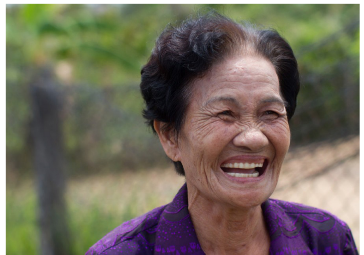
A listener from Myanmar

Wed 21 – The team broadcasts in ethnic languages and go to great lengths to respond to and follow up on all listener responses. Pray that they can persist with these sometimes draining efforts.