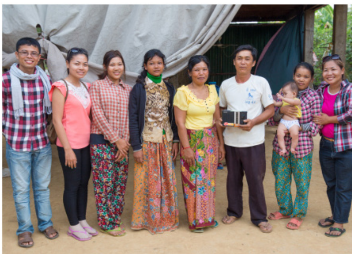
FEBC Cambodia's team regularly visits listeners and distribute radios.

Thu 1 – Our team in Cambodia is so encouraged by