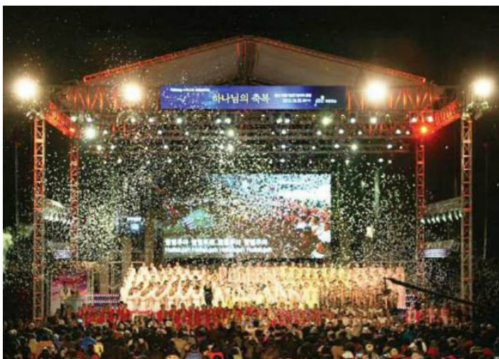
On 24 June 2016, 500 children from FEBC South Korea's children choir performed in New York City to celebrate FEBC Korea's 60th Anniversary.

Sun 22 – WEEKLY SUMMARY: 39% of South Korea's 49 million people are Christians, making Christianity the majority religion in South Korea. In December 1956, HLKX Seoul was established to broadcast the gospel to North Korea, China, Russia, and Mongolia – countries where missionaries were not allowed. Pray with us for FEBC Korea, which has