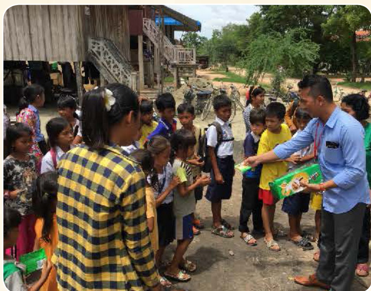
Radio distribution in Cambodia

Sun 3 – WEEKLY SUMMARY: In 1957, years before the word 'genocide' was associated with Cambodia, FEBC began broadcasting the gospel into Cambodia from its shortwave station in the Philippines. Broadcasts continued into Cambodia as the turbulence of the Vietnam War spilled across its borders, ravaging its land and people. In 1995, the government allowed national programmers to establish FEBC Cambodia's first office and studio in the capital of Phnom Penh. Please pray for FEBC Cambodia, especially their Na-