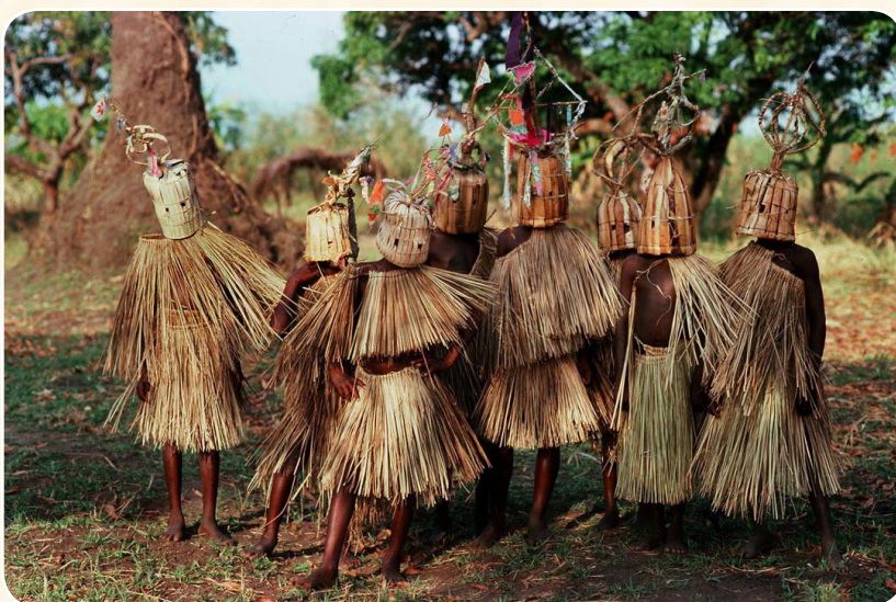
Yao children in Chiconono, Mozambique

Sun 26 – WEEKLY SUMMARY: Through FEBA Malawi's ministry we reach the Yao