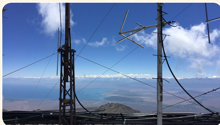
The tower at the Issyk-Kul station