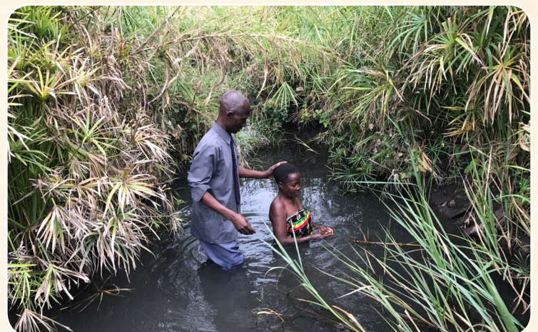
New believer baptised in Malawi

Sat 18 – Apart from the live broadcasts and radio programs, FEBA Malawi also conduct leadership sessions where church leaders gather for fellowship and training. Pray for this additional ministry.