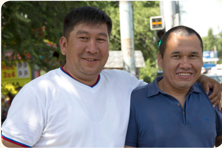
Listeners in Kazakhstan face persecution

Sun 7 – WEEKLY SUMMARY: According to a recently published article from ‘Christianity Today’, Kazakhstan’s youth are the fastest-growing group of Christians in the country. The generation that came of age just after the downfall of the Soviet Union, are now forming the foundation of many Kazakh churches. An English teacher who helps at one of these student-run churches says; “I believe many Kazakhs will accept Jesus as their God and Saviour, and there will be many churches formed. There is a great awakening in Kazakhstan”. Thank the Lord for the First Generation Church in Kazakhstan. Pray that FEBC’s broadcasts will continue to change the hearts of all the people of this nation, young and old alike.