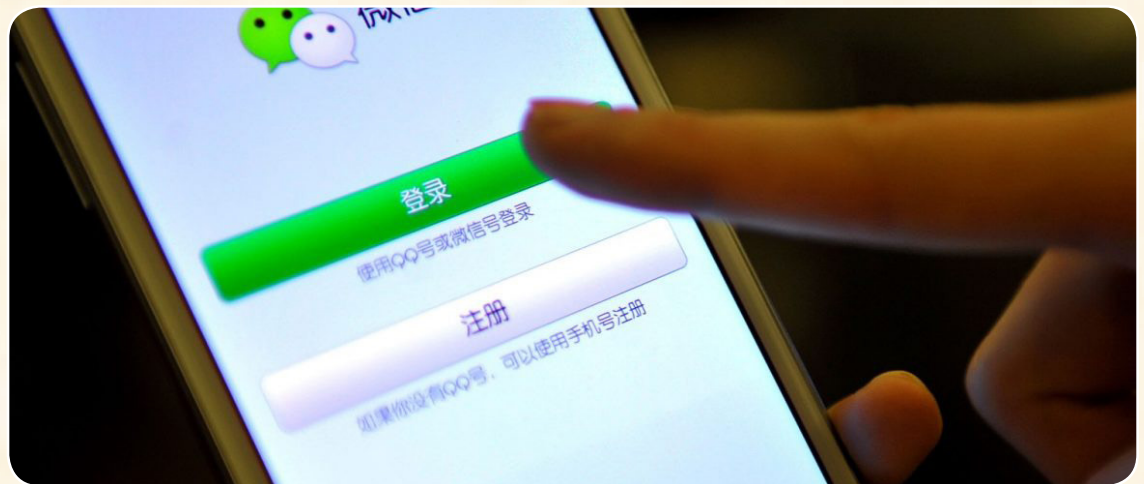
FEBC uses WeChat in China

App on Android phones was completed and more than 10 programs are scheduled on this App. Pray that listeners will listen to the programs on their mobile phones.