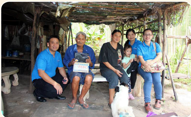
Radio distribution in Thailand

Sun 11 – WEEKLY SUMMARY: Thai broadcasts, produced by both FEBC Thailand and a second Thai production studio, was aired from the Philippines until 1976. FEBC Thailand has long maintained close ties with other missionary organisations in Thailand. They also became very involved with emergency broadcasts and radio distribution following the 2004 tsunami and the 2011 Bangkok