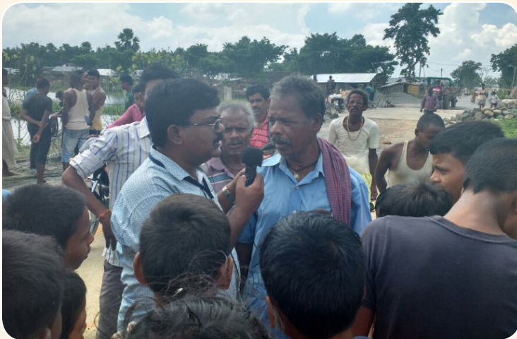
First Response Radio in India

Sun 17 – WEEKLY SUMMARY: FEBA India's ethnic radio programs are specially designed to suit their audience in their own language and culture. Each letter, phone call, email and text message is responded to personally. They are unique in relevantly presenting the gospel to the people, to evoke a genuine response to the Lord and enable them in turn to live a life of abundance. Praise God for this ministry as their broadcasts can reach almost 300 million Indians with the Good News of Jesus Christ.