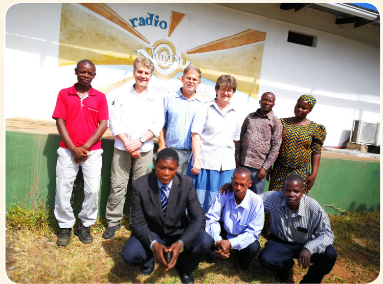
Radio Nuru Board in Mozambique

Thu 23 – Ask God to bless the Radio Nuru staff and their families for dedicating their lives to proclaiming the gospel to their countrymen. Pray that God will bless our new partnership with them.