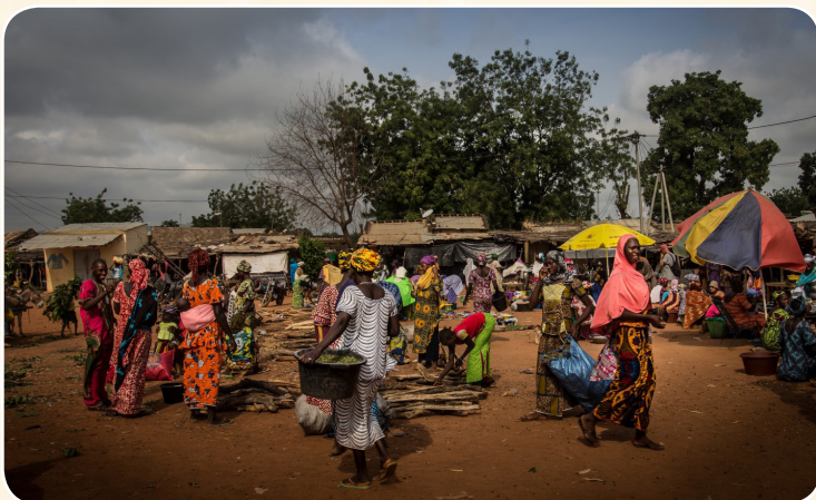
Market in Manatali, Mali