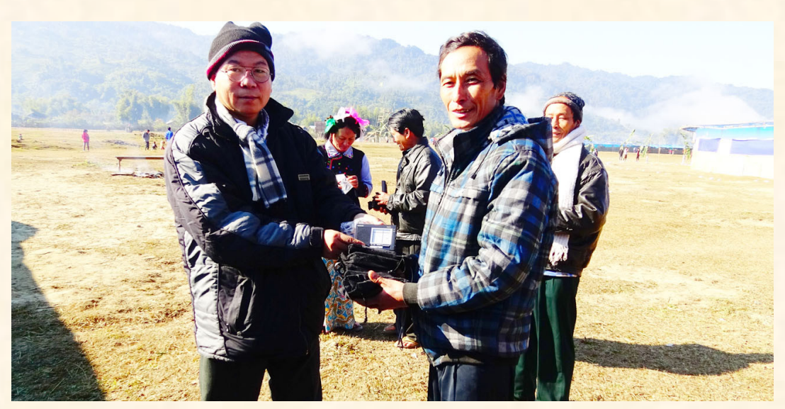
Photo: FEBC Radio International Thailand's radio distribution project.

Sat 27 – Please pray for good health and safe travel to and from work, for each of FEBC Thailand's staff members. They sometimes have to travel far and through harsh conditions to get to work. Pray that God will bless their work and their families.