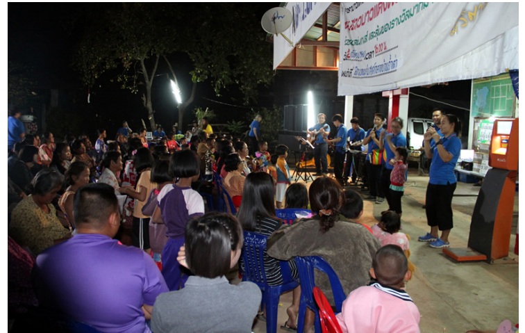
FEBC Thailand Listener's Rally

travelled to Tham Tavee, Tambon Tham Khao and Ubon Ratchathani villages in Thailand, as a part of their radio talk show entitled, 'Meet the listener with love at heart'. Many of the listeners, who they visited that day, accepted Jesus Christ as their Lord and Saviour. Praise the Lord for open hearts!